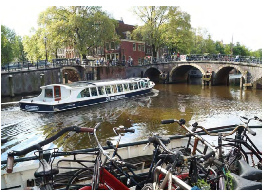
Bikes and Boats

Holland is famous for its great painters and Amsterdam attracts millions of visitors to its rich collections of paintings in its many beautiful galleries. The Dutch capital is such a photogenic city with bikes parked alongside the canal railings at just the right angle, boats chugging under very low bridges, people living and working on the water and flowers everywhere. From Central Station buses and the Metro provide fast and inexpensive transfers to all parts of the city but the best way to explore is by bike or on foot. Cycling is safe and bikes take priority over cars. Solid upright bikes are everywhere and much more use in the city than cars. You'll often see several passengers on a bike with sidecar amidst heaps of shopping bags.