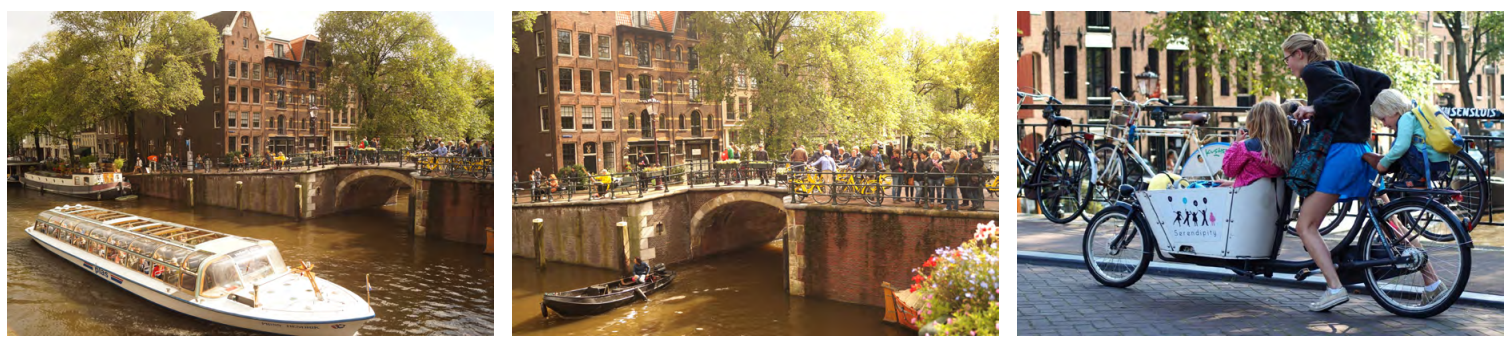
Sightseeing by Boat